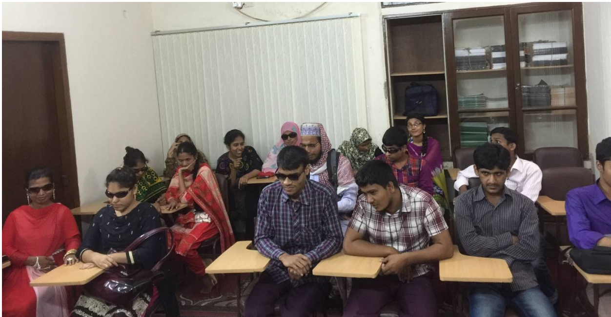
Visually Impaired Students in Institute's Training on Spoken English

Training for visually impaired on Information Technology, PABX & Call Center, and Spoken English: The Institute of Hazrat Mohammad SAW is a think tank which focuses on improving the lives of persons with disabilities through different projects. It provides free-of-charge IT training and free access to its IT center/lab for visually impaired persons. The main components of the IT program is to acquaint students to computer screen reading software, speech synthesizers, and self-voicing software, web surfing, using Microsoft Word, Excel, PowerPoint with JAWS and DAISY. These lessons are aimed towards helping them gain better access to information and enhance their knowledge and learning. Since 2013, the Institute has started training on PABX and call center operations to help visually impaired persons gain employable skills. Till date the Institute has provided training for over 300 visually impaired individuals since its inception in 2003.