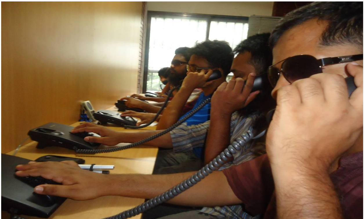
PABX training session for visually impaired persons at the Institute of Hazrat Mohammad SAW