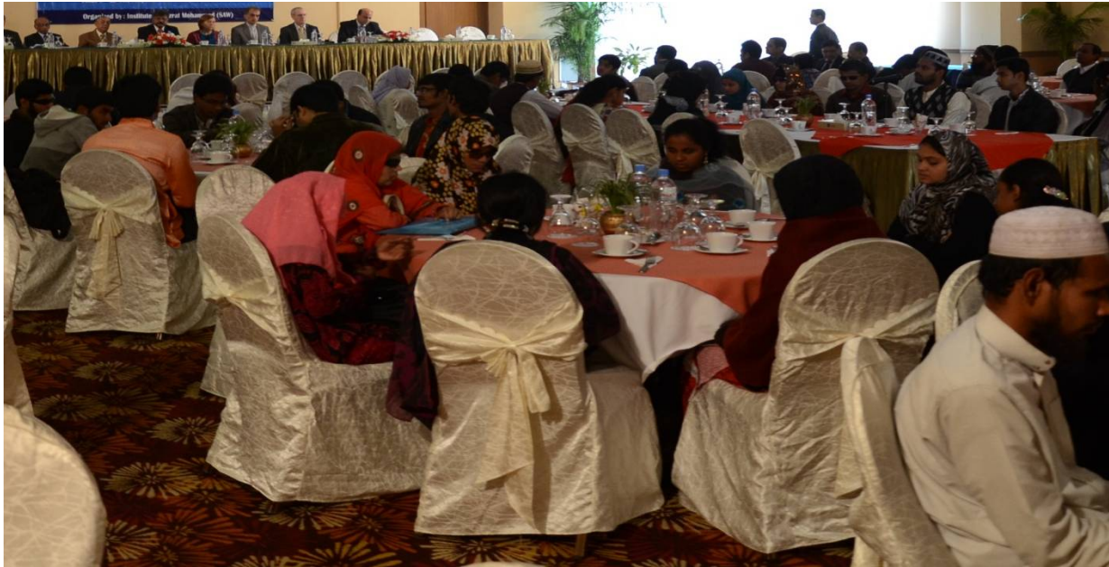
Seminars on Human Rights organized by the Institute of Hazrat Mohammad SAW